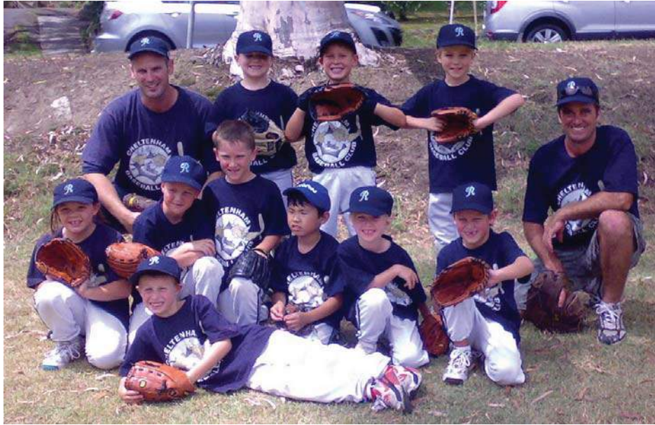
Tee-ballers and Juniors at Cheltenham Baseball Club!