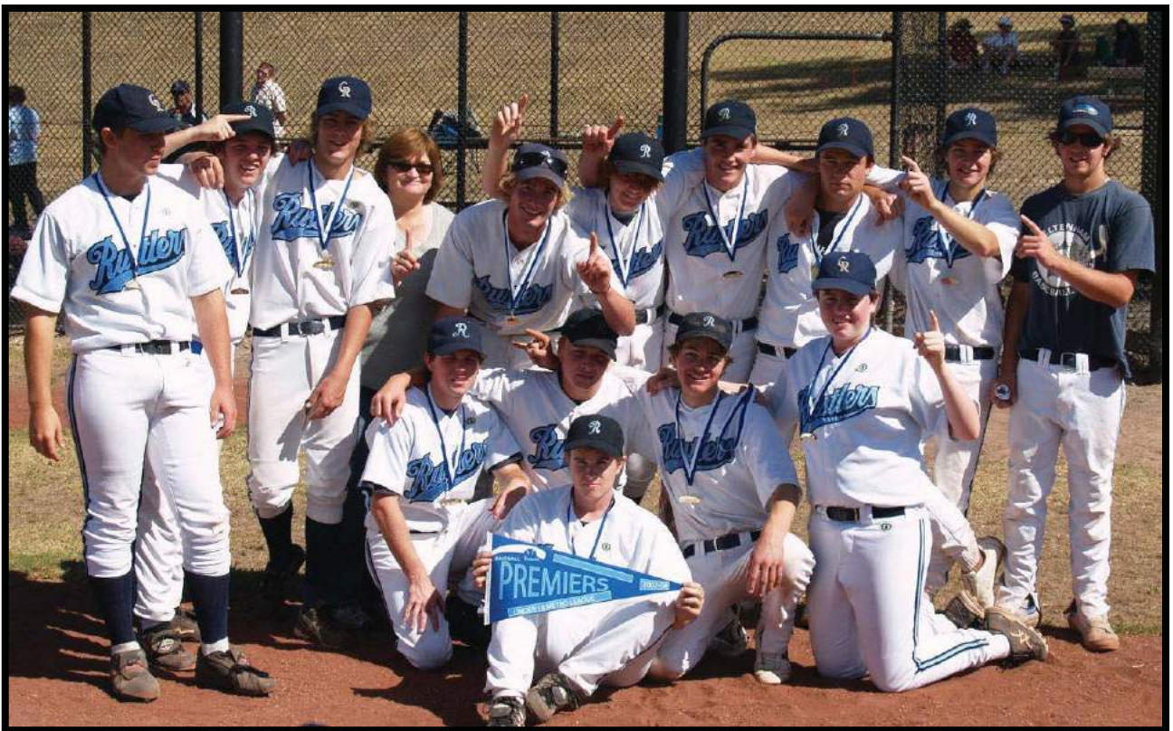
U18 Metro Premiers 2007-2008

SENIOR PRESENTATION Saturday, 12 April 2008