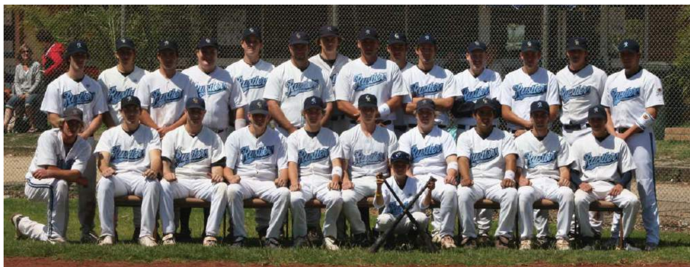
2007-08 First Nine Team Photo