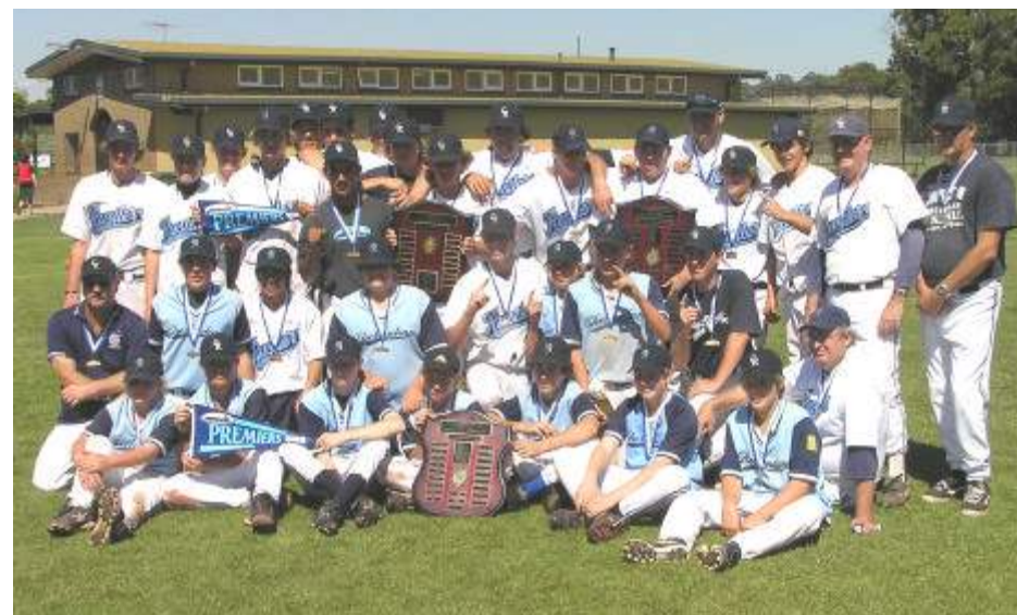
Under 14, Under 16, Under 18 State League Grand Final Winners