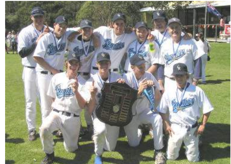
Under 18 State Rustlers Grand Final Winners 2004-05

The AGM for Cheltenham Baseball Club—Summer Committee will be held at the Clubrooms, Cheltenham Baseball Club, Kingston Heath Reserve, Farm Road, Cheltenham, Thursday, 26 May 2005 at 7.30pm.